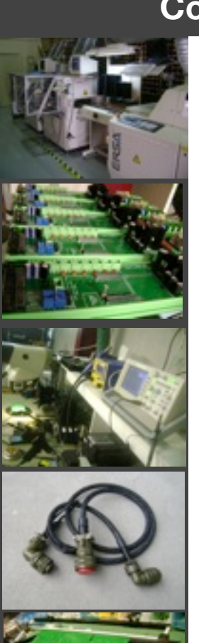
Good Service At fair cost Fast TAT